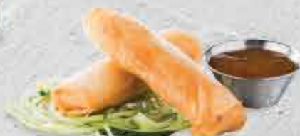
SPRING ROLLS R55 2 Deep-fried phyllo spring rolls, filled with prawn & cheese.