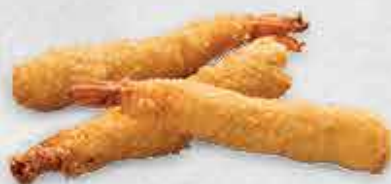
PRAWN TEMPURA R65 3 Prawns dipped in tempura batter, rolled in crispy tempura flakes & delicately deep-fried. Served with sweet chilli sauce.