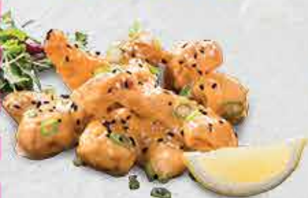
POPCORN PRAWNS R62 New 6 Popcorn prawns, tossed in a bang bang sauce & sprinkled with spring onion & sesame seeds.