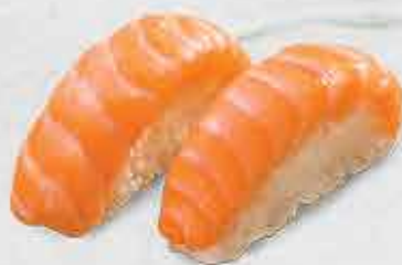
NIGIRI R62 2 Pieces of salmon nigiri.