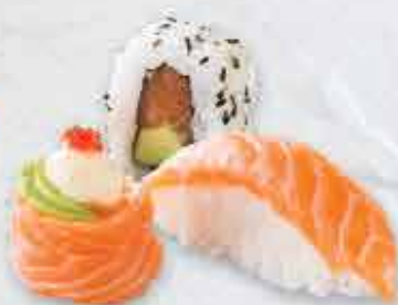
TRIO R62 1 Salmon California roll, 1 salmon rose & 1 salmon nigiri.