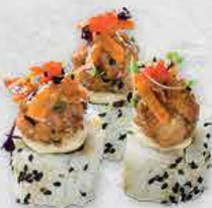
HOT TUNA & HONEY AVALANCHE R65 3 California rolls topped with saffron chutney & coriander infused panko-crusted tuna balls. Topped with spicy atchar & our signature spiky honey sauce.