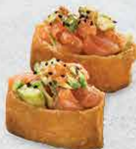
BEAN CURD R65 2 Pockets made from inari (fried soya beans) filled with rice, avo, Kewpie mayo, Seven Spice & your favourite filling. SALMON/PRAWN