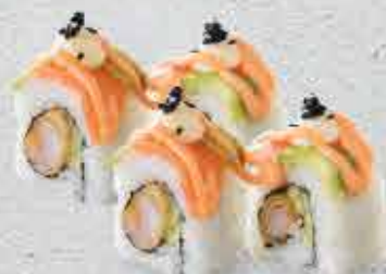
TEMPURA RAINBOW ROLLS R65 4 Tempura prawn California rolls with delicate slivers of salmon & avo. Topped with Sriracha mayo, Kewpie mayo & caviar.