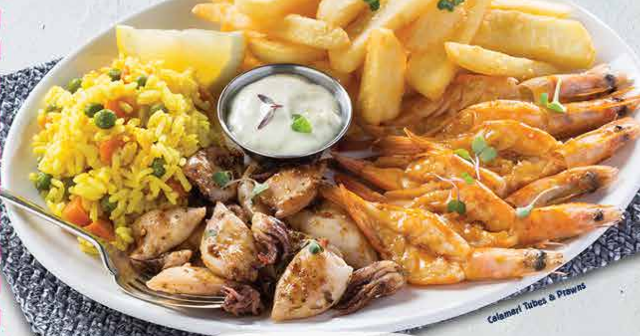
Calamari Tubes & Prawns