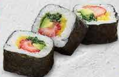
VEG FUTOMAKI ✓ R45 3 Futomaki rolls filled with strawberry, pickled radish, cucumber & avo.